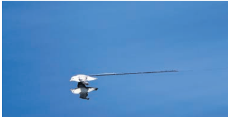
A northern fulmar bird skims the water while flying over the Bering Sea off the coast of Alaska, Friday, July 14, 2017.